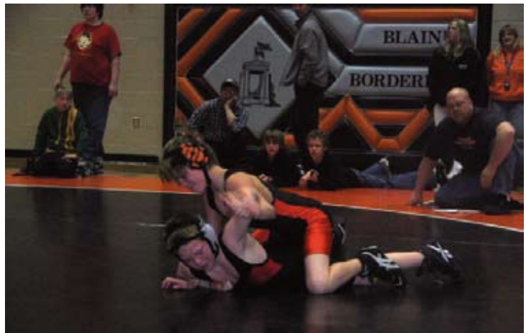
Auto Levels applied