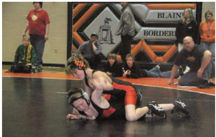
Fixed using our method